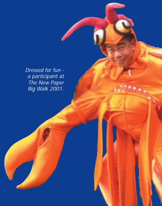
Dressed for fun - a participant at The New Paper Big Walk 2001.

SPH Classified organised the first Pink Slip Party in Singapore. Some 1,200 professionals in information technology registered for the party. Originated in the United States of America, the Pink Slip Party is a way for out-of-work information technology professionals to get jobs in a casual, party-like atmosphere.