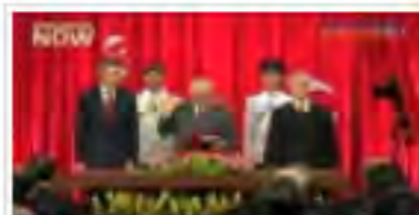
President Tony Tan calls for unity among Singaporeans