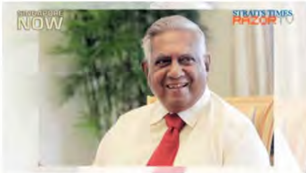
What S R Nathan did for Singapore