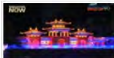
Mid-Autumn Festival by the River kicks off