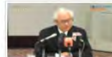
Tony Tan aims to reach out to Singaporeans