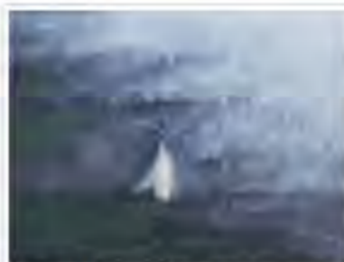
TODAY IN PICTURES Sep 1 - World Championships