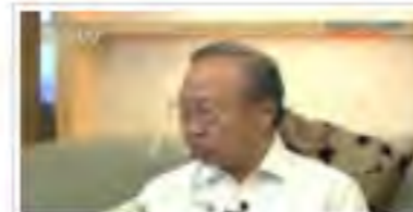
Cheng Bock: Division among Singaporeans and within PAP