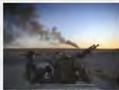
TODAY IN PICTURES Aug 30 - Libya and more