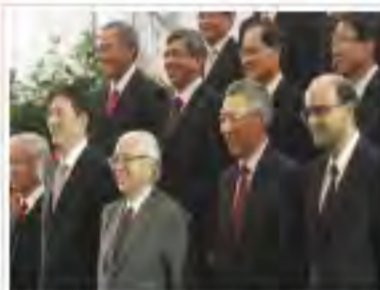
TODAY IN PICTURES Sep 2 - New president, and more.