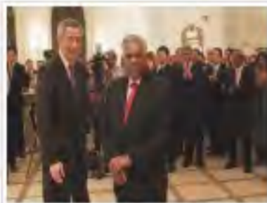
TODAY IN PICTURES Aug 31 - Ms Universe, US Open and more.