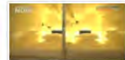
Flashpack and sleep in a pod