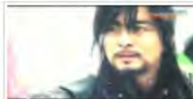
K-pop fans go beyond Bae Yong Joon (Korean fair Pt 1)